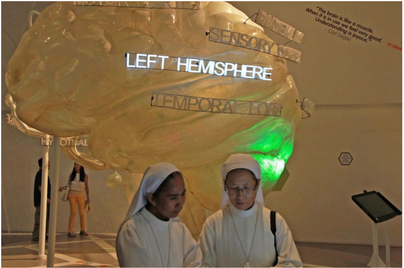
The Brain Museum in Manila, Philippines.

Genuine respect for cultural heritages 10 that condition moral values and priorities begins with and derives from the people themselves. All of the benefits, burdens, risks, and potential harms of neuroS/T to persons—regarded both as individually separable and as communally integrable—require honest assessment prior to any evaluative or prescriptive stage. To structure this assessment, we have proposed, and here again endorse a multi-component, multi-step risk assessment and mitigation approach. 11 Rather than exemplifying any singularly nationalistic agenda, this assessment schedule would be useful for enabling international and cross-cultural deliberations to proceed in a disciplined manner. As shown in Table 1, discourse toward guidance and direction starts with and proceeds from exploratory questions rather than accusatory dictates, and then frames and analyses the responses to these queries, addressing particular contingencies in defined contexts.